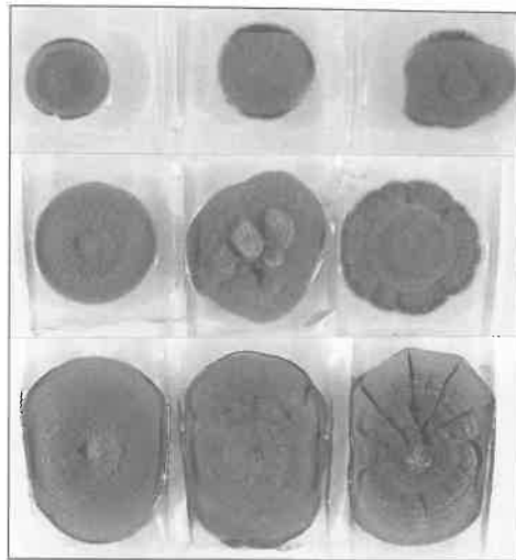
Photo 1 Cercospora colonies on Mycophyl Agar from single ascospores of Mycosphaerella musae from banana leaves infected with M. musicola in Guadeloupe. From top to bottom, colonies are 7 days (7-9 mm), 10 days (12-14 mm) and 14 days (21-22 mm). Cercospora "non-virulentum" colonies were identical to the colonies shown.